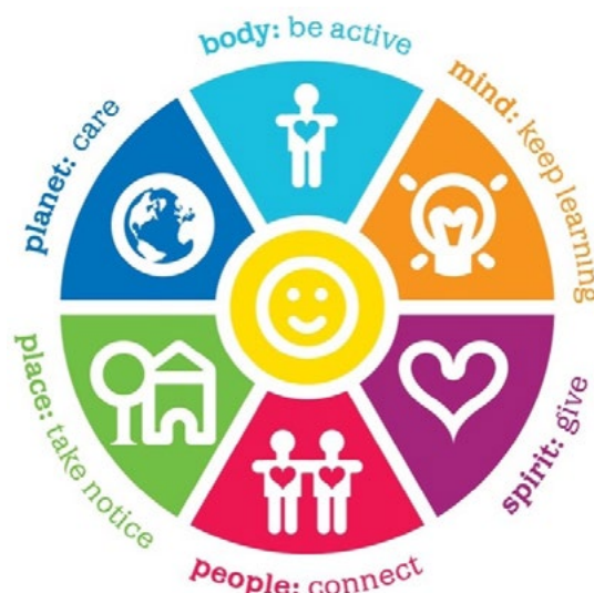
The Wheel of Wellbeing

The Wheel of Wellbeing (WoW) is made up of six elements that contribute to positive mental health and wellbeing: Body – be active; Mind – keep learning; Spirit – give; People – connect; Place – take notice; and Planet – care.